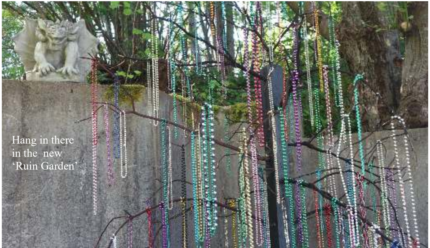
Hang in there in the new 'Ruin Garden'