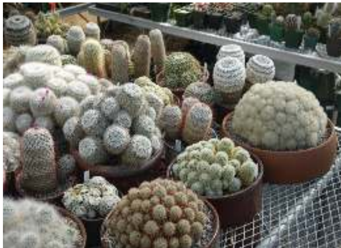
Sarracenias and other cacti, succulents and pottery will be available for sale.