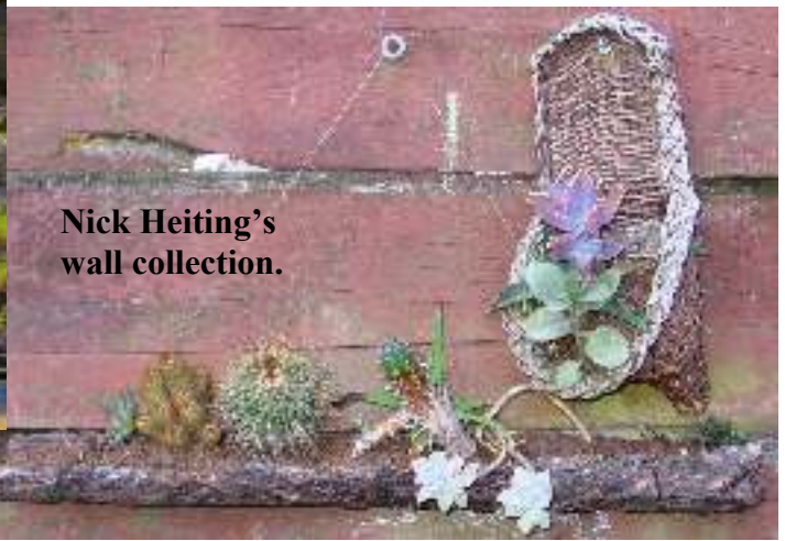
Nick Heiting's wall collection.

Ground too wet or doesn't drain well? Put your cacti in pots.