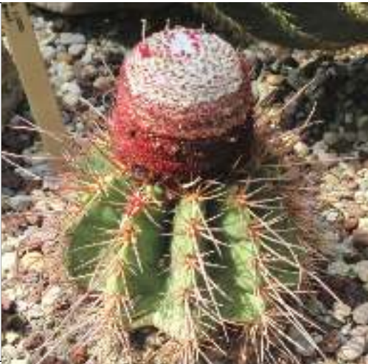
Oreocereus celsianus Old Man of the Andes

Membership dues remain at $20.00 per year. Dues can be brought to a meeting or mailed to: